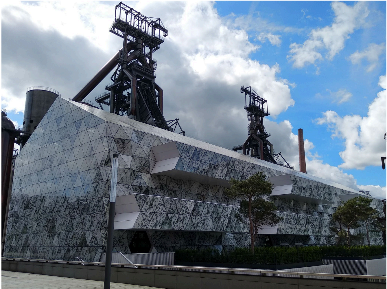
[University Campus, Belval, Luxembourg, new library in front and blast furnace in the background]